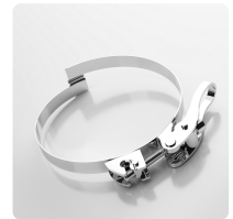
Master-Grip Quick-Fix Clamp Special clamp for fastening light and medium-weight, right-hand spiral hoses such as Flamex B-se, Flamex B-F se, Master-PUR Trivolution, Master-PVC and Master-SANTO