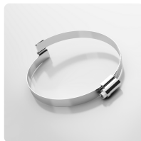
Master-Grip Hose Clamp, screwable Special clamp for fastening light and medium-weight, right-handed spiral hoses such as Flamex B-se, Flamex B-F se, Master-PUR Trivolution, Master-PVC and Master-SANTO