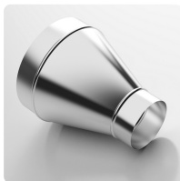
Hose Reducer, symmetrical Hose reducer for extending, connecting and joining light to medium weight hoses