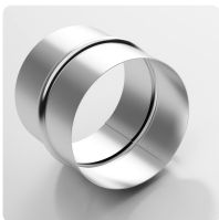
Hose connector Sheet steel connector for extending, connecting and joining light to medium-weight hoses