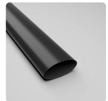
Heat Shrink Cuff Heat shrink sleeve for easy connection and sealing of hoses