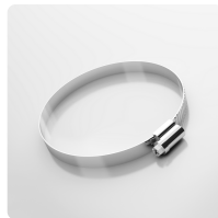
Hose Clamp with Worm-Gear Standard clamp for fastening light hose types to connecting pieces on mobile and stationary installations